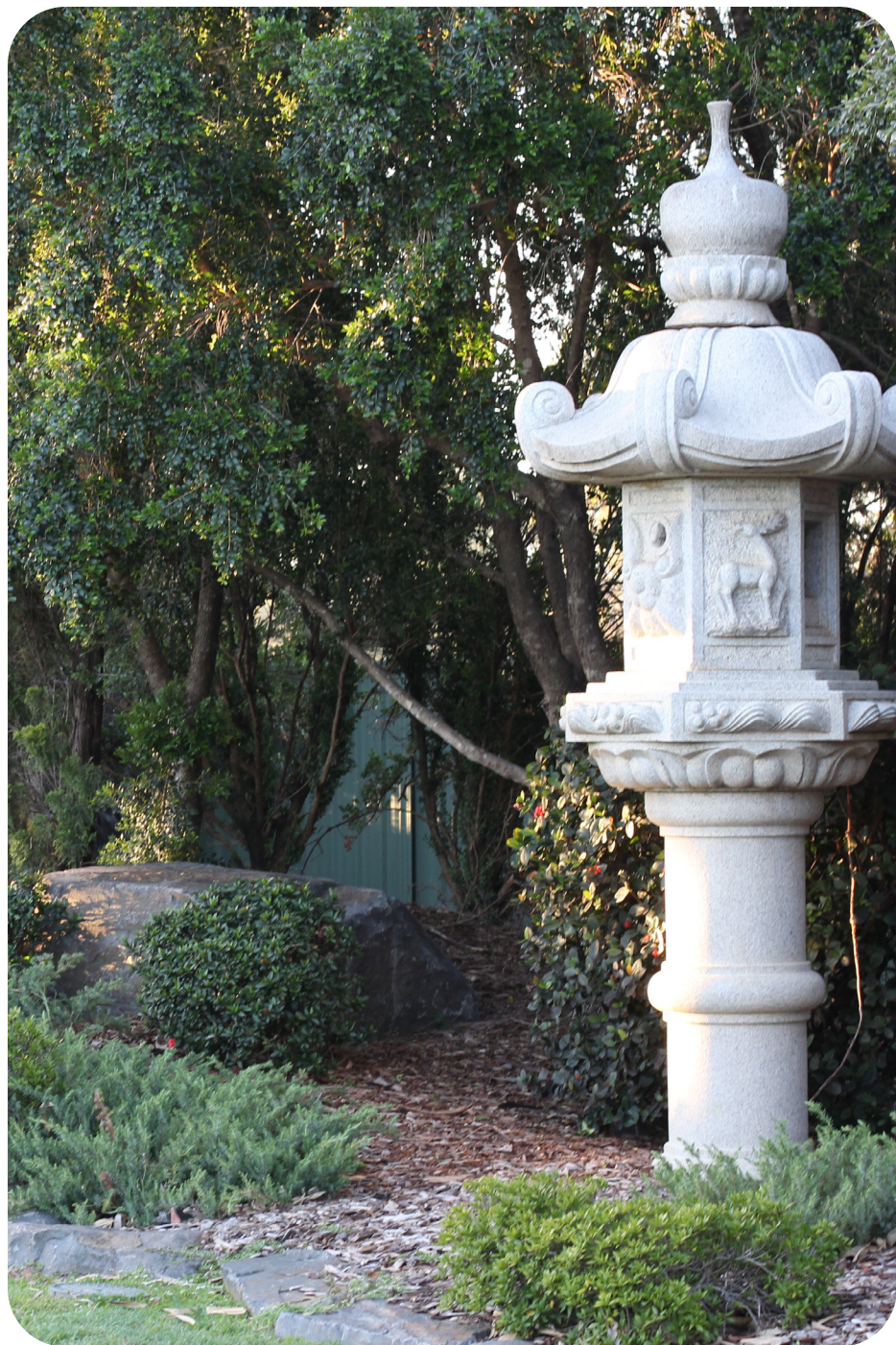
Blackwater Japanese Garden