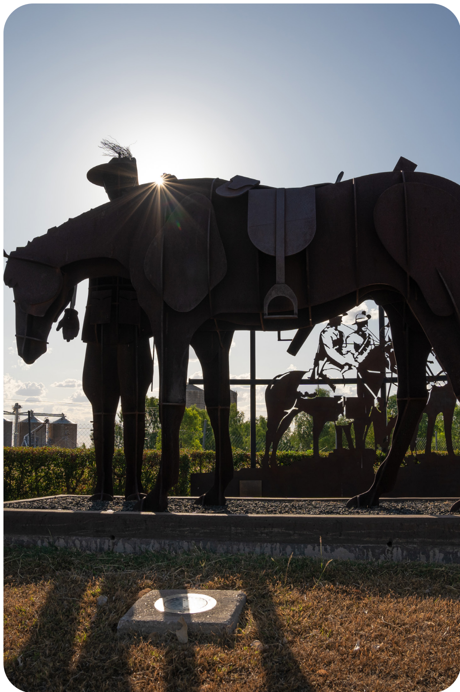
Capella Lighthouse Memorial