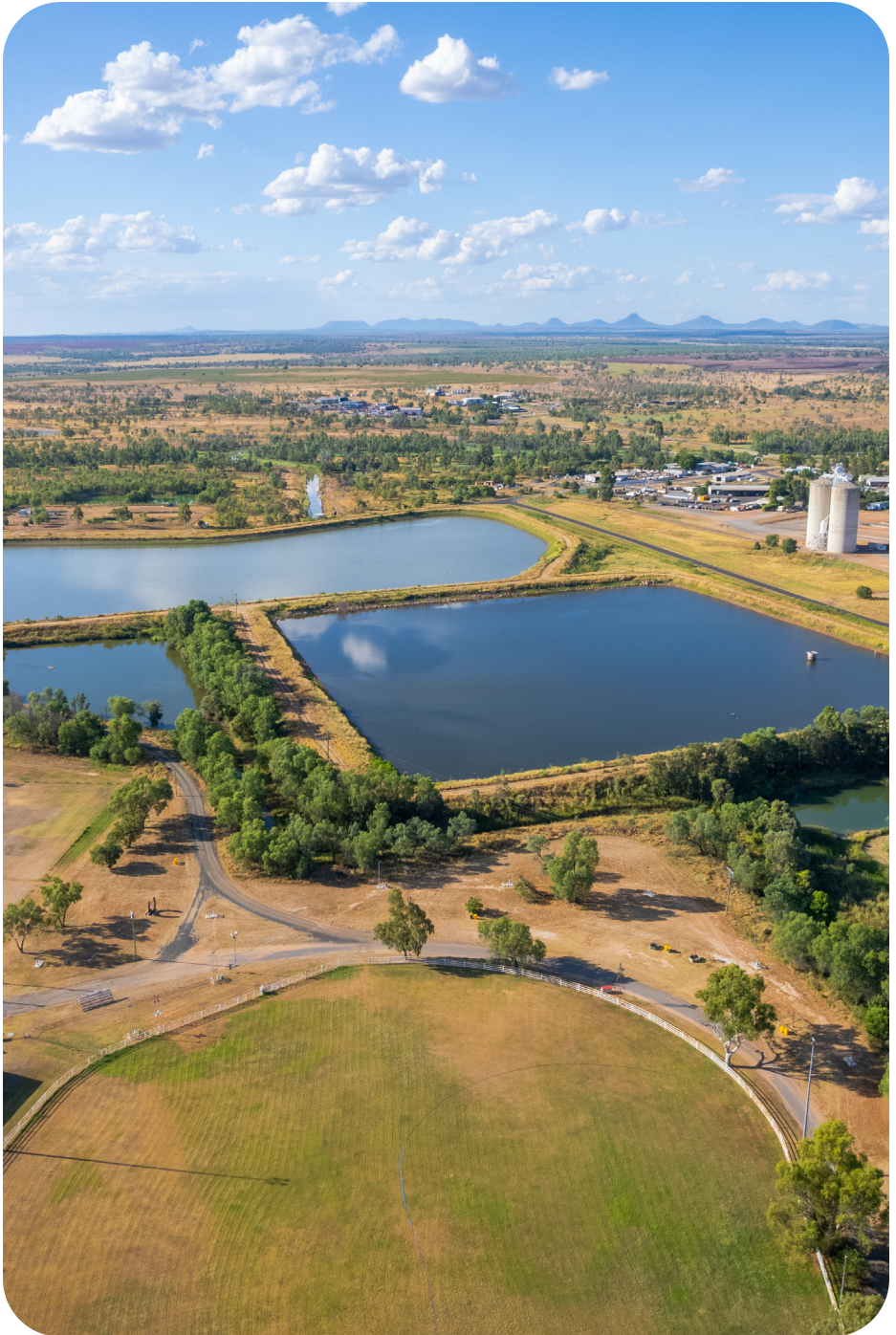
Capella aerial view